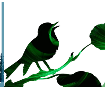
FOLK SONG FÊTE