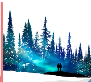
CHRISTMAS WITH ORPHEUS