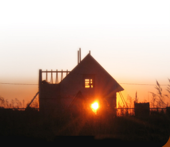
HOME AND PAST